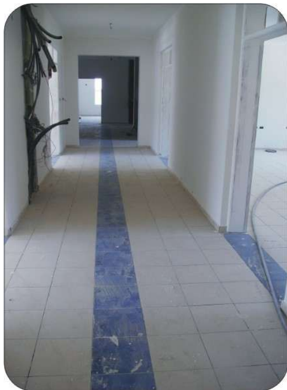
One of the corridors on the second floor leading to classrooms

After very extensive deliberations, we decided to put forward the date of the inauguration of the new purpose built Al-Shurooq School for Blind Children's building towards the last week of November.